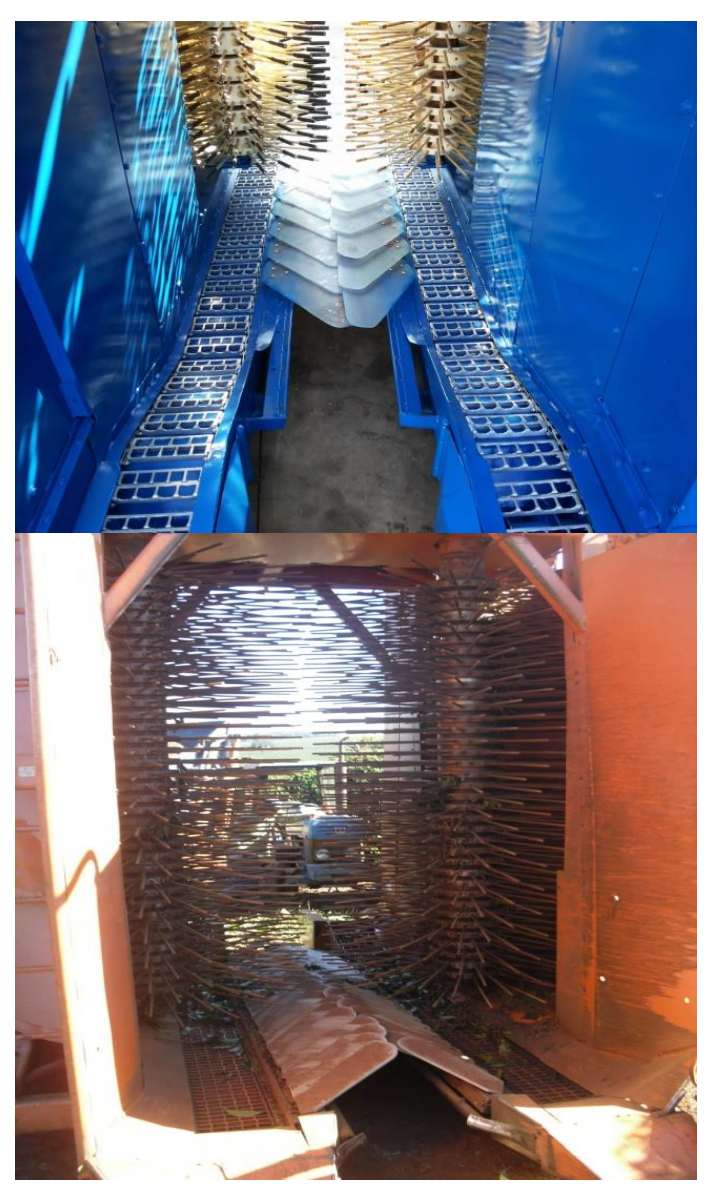
Fig 1. A adapted and conventional harvesters.

* The values referring to conventional and adapted harvesters, respectively.