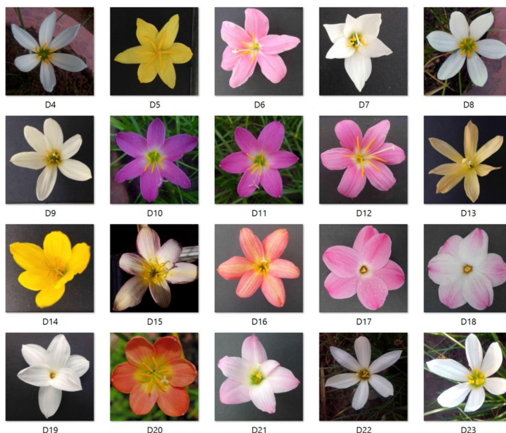
Figure 1. Flower of the experimental rain lily genotypes.

wider range of chromosome numbers was reviewed by Bhattacharyya (1972) from 2n = 12 to 2n = 120 . The smallest chromosome number was revealed by Daviña et al. (2019) with 2n = 10 in Z. seubertii . Meanwhile, the largest chromosome number was found in a horticultural hybrid 2n = 200 (Flory and Smith, 1980). In our study, the chromosome numbers of rain lily genotypes are presented in Table 3 and Figure 2. The genotype D18 ( 2n = 18 ) had the lowest chromosome number followed by D7 ( 2n = 22 ). D6 is the genotype that had the highest number of chromosomes